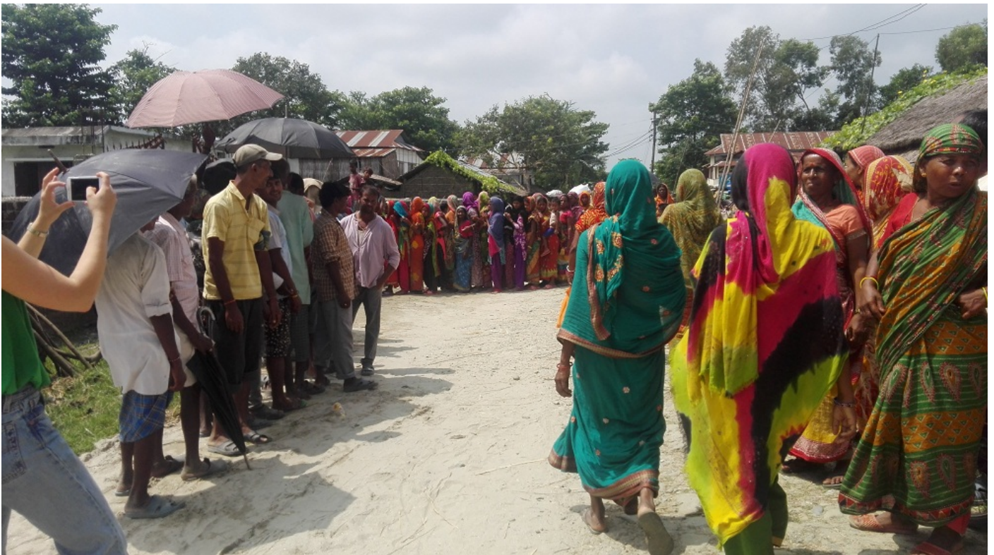
Flood affected people lined for receiving relief materials in Ratuwa Mai Municipality of Morang district.