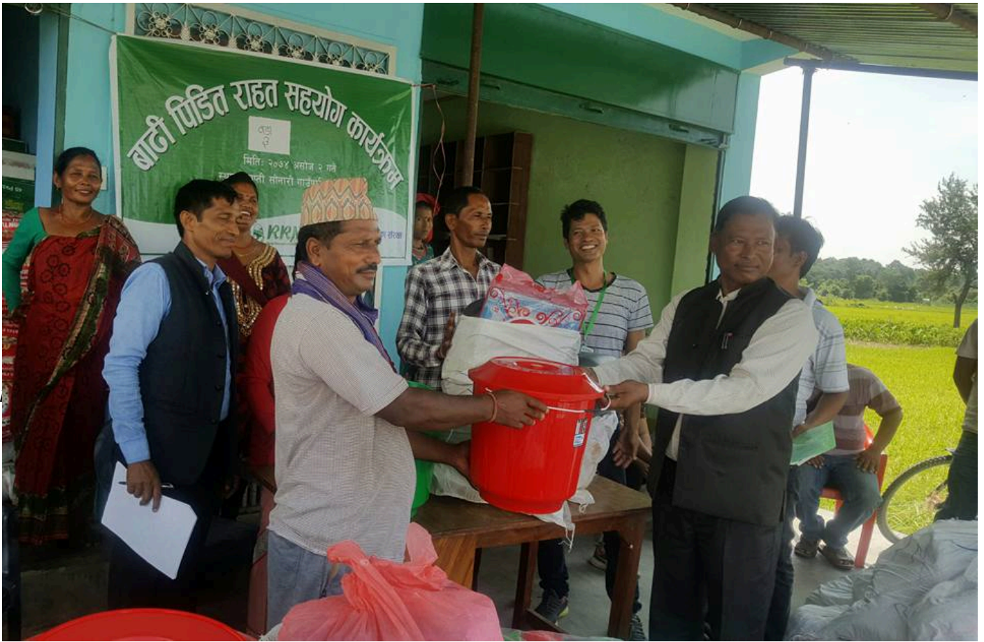
Relief materials being distributed in Rapti Sonari RM in Banke district.